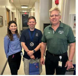
Supporting the Relentless Champions working at NKC Schools